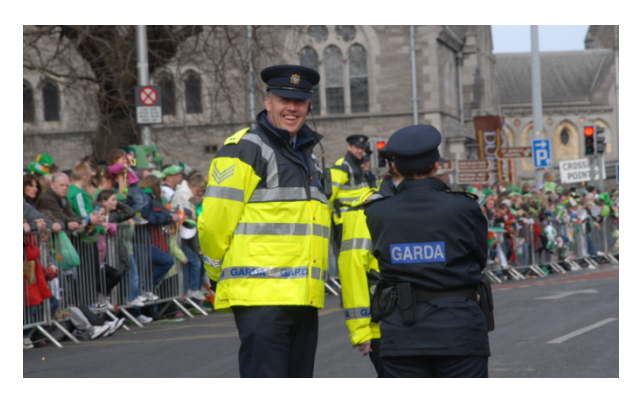
St Patricks Day Parade at Christchurch Dublin

The Dublin City Festival of Russian Culture, music dance and live performances took place from 9<sup>th</sup> to 15<sup>th</sup> March followed by the annual St. Patrick's Festival which this year saw an extra 8,000 overseas visitors take part in the very special event, the People's Parade.