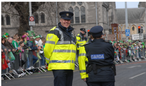
St Patricks Day Parade at Christchurch Dublin

The Dublin City Festival of Russian Culture, music dance and live performances took place from 9 th to 15 th March followed by the annual St. Patrick's Festival which this year saw an extra 8,000 overseas visitors take part in the very special event, the People's Parade.