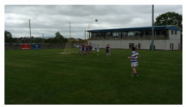
Park, the home of St Patricks GAA Club Tullow Co. Carlow on Sunday 1<sup>st</sup> September 2013.

The annual Tullow Garda Sponsored U/10 GAA Football Blitz was once again held at Brother Leo